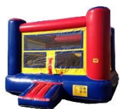
Inflatable Bounce House