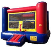
Inflatable Bounce House