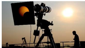
Watch it live streamed from the telescope!