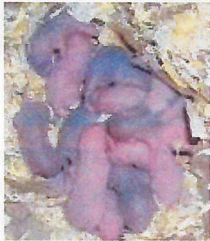
NEST OF BABY RATS