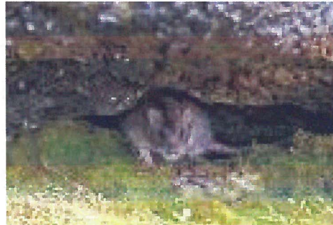
RAT LEAVING BURROW

Lake County General Health District Environmental Health Services 5966 Heisley Road Mentor, Ohio 44060 (440) 350-2543 www.lcghd.org