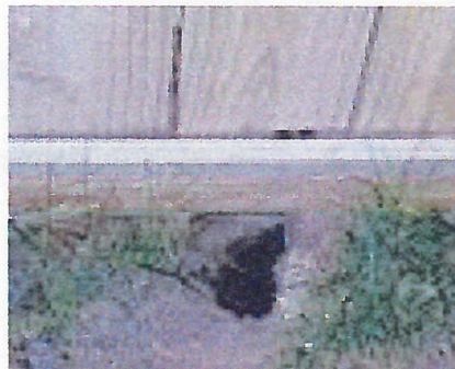
RAT BURROW ALONG FENCE